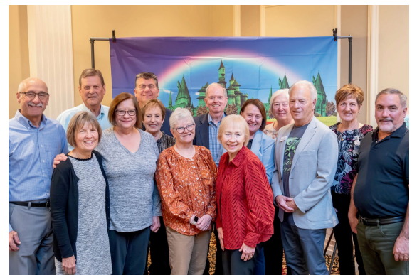
Members of St. John United Church of Christ supported and enjoyed FamilyForward's 2024 Giving Hope event.